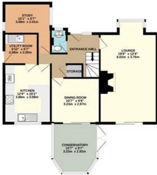
GROUND FLOOR 804 sq.ft. (74.7 sq.m.) approx.