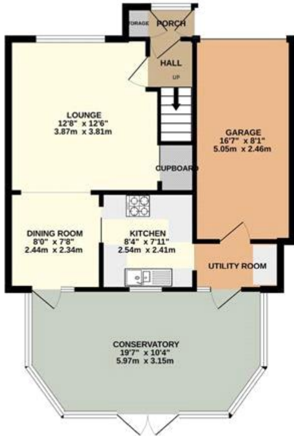
GROUND FLOOR 686 sq ft. (63.8 sq.m.) approx.